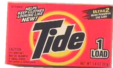
Powdered Laundry Detergent

Talc is the most popular filler in powdered laundry detergents.